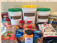
All donations welcome